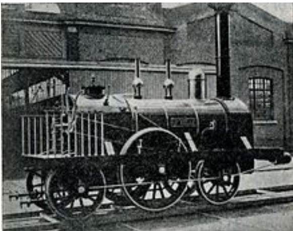
Le Belge ("The Belgian"; 1835) was the first steam locomotive built in continental Europe

On 21 July that year Leopold of Saxe-Cobourg took his oath as King of the Belgians on 21 July 1831, an event commemorated annually as Belgian National Day. His reign was marked by attempts by the Dutch to recapture Belgium and, later, by internal political division between liberals and Catholics. As a Protestant, Leopold was considered liberal and encouraged economic modernisation, playing an important role in encouraging the creation of Belgium's first railway in 1835 and sub-sequent industrialisation. The king's vow marked the start of the independent state of Belgium under a constitutional monarchy and parliament. The great powers of the time then recognised the Belgian independence.